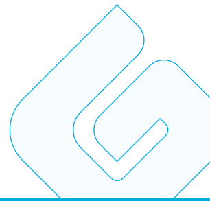
TABLE OF CONTENT