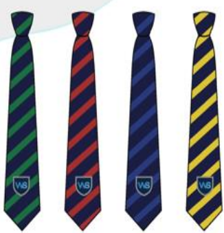
Y1-Y3 ELASTIC TIE Y4-Y6 FULL TIE